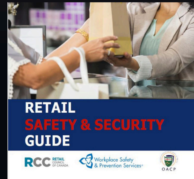
Retail Safety & Security Guide