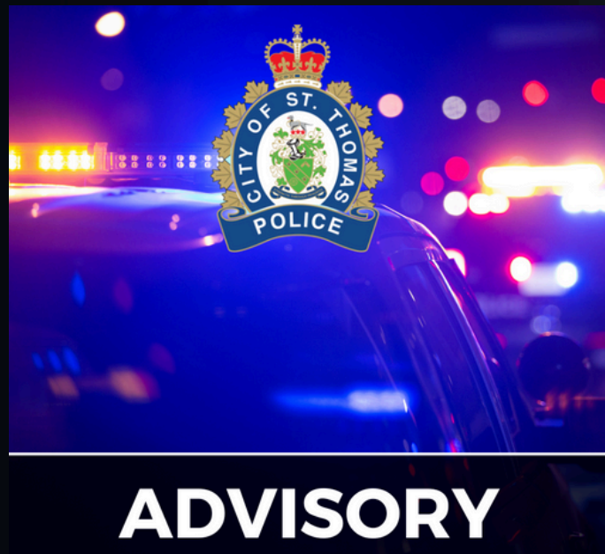
STPS warns of Grandparent Scam