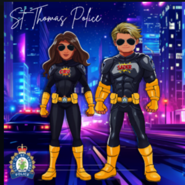
Revitalized Youth Engagement Initiative