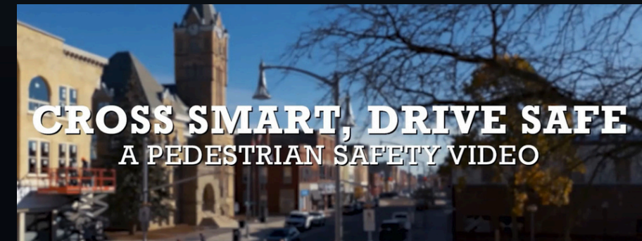
Cross Smart, Drive Safe A pedestrian safety video