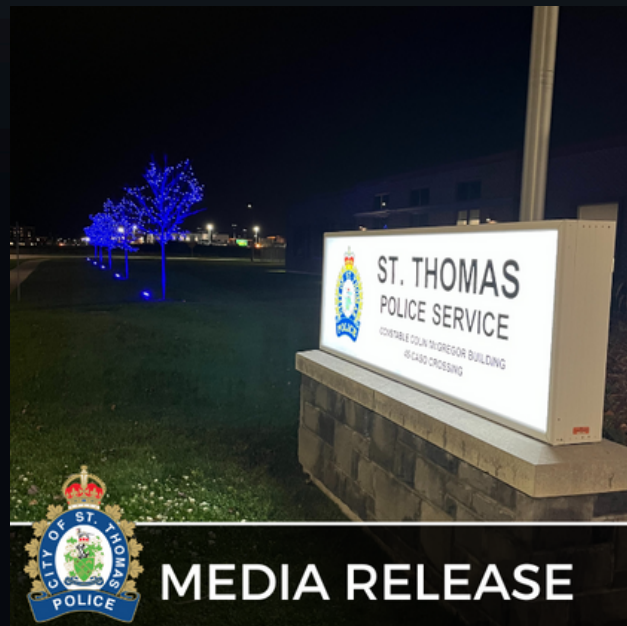
Festive Mischief at STPS HQ