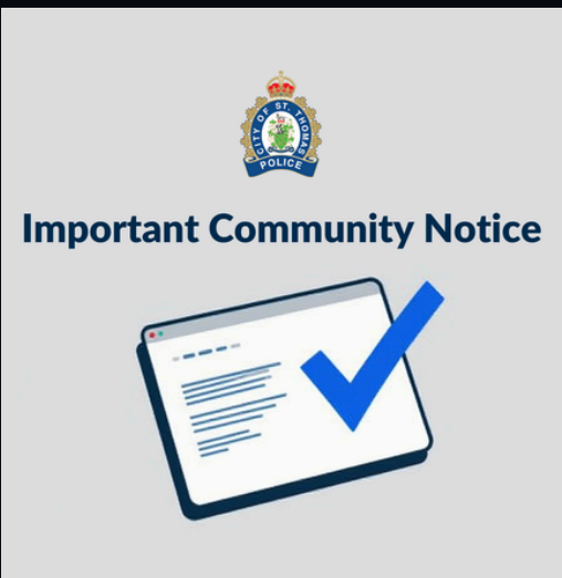
BROAD RECORD CHECKS NOW BEING PROCESSED BY STPS