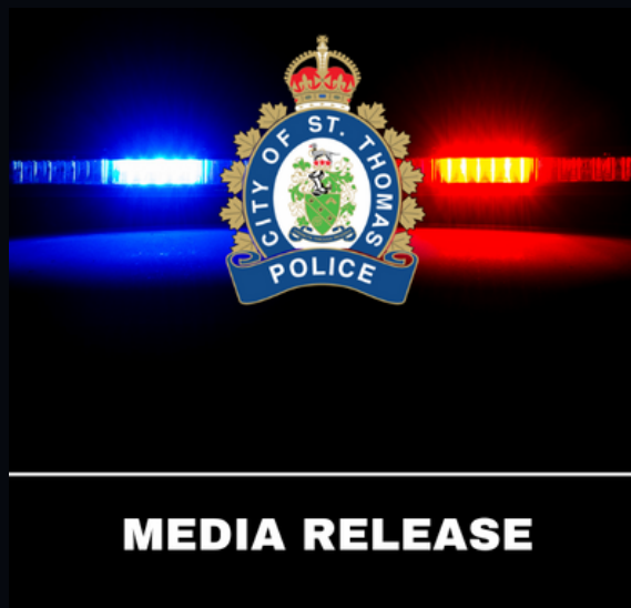
20,000 CALLS FOR SERVICE EARLIER THAN EVER BEFORE