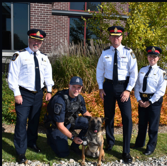
STPS ANNOUNCES DEPLOYMENT OF NEW CANINE TEAM