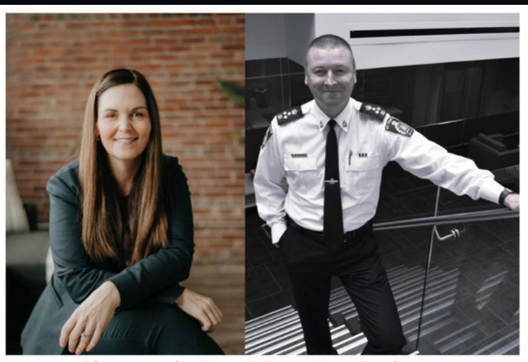
WELLNESS NAVIGATION PROJECT MAKES TOP 10 - BLUE LINE MAGAZINE