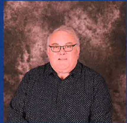
Mayor Joe Preston