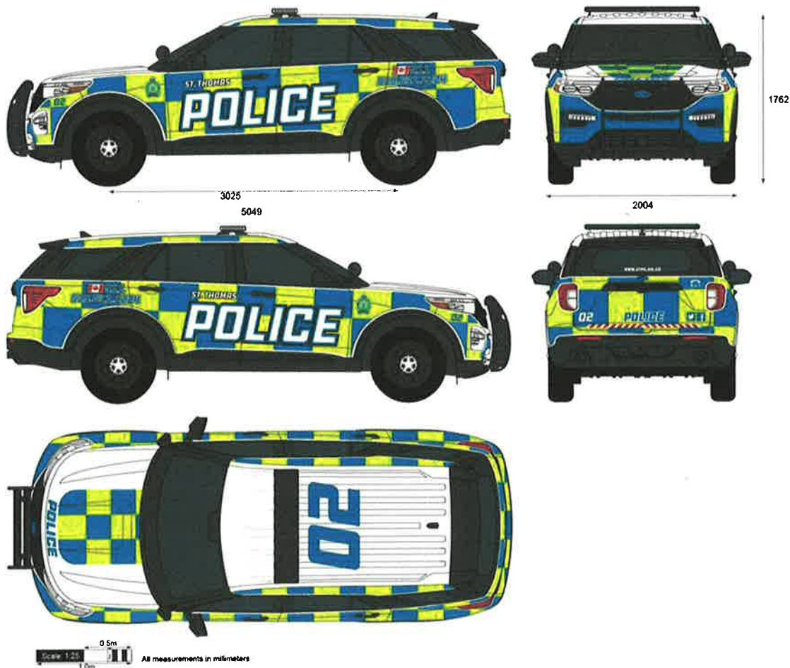
St. Thomas Police Service Ford Explorer Police Interceptor Utility (2020)

We are aware that the use of the Battenburg vehicle design has been researched and is under consideration by the Barrie Police Service and the Edmonton Police Service. In efforts to further modernize STPS service delivery capabilities, it is our intention to apply the Battenburg markings on one STPS police vehicle (2021 Ford Explorer) immediately. Pending favorability of this progressive design, we will make an operational determination on replicating the Battenburg markings on future vehicles introduced into our fleet.