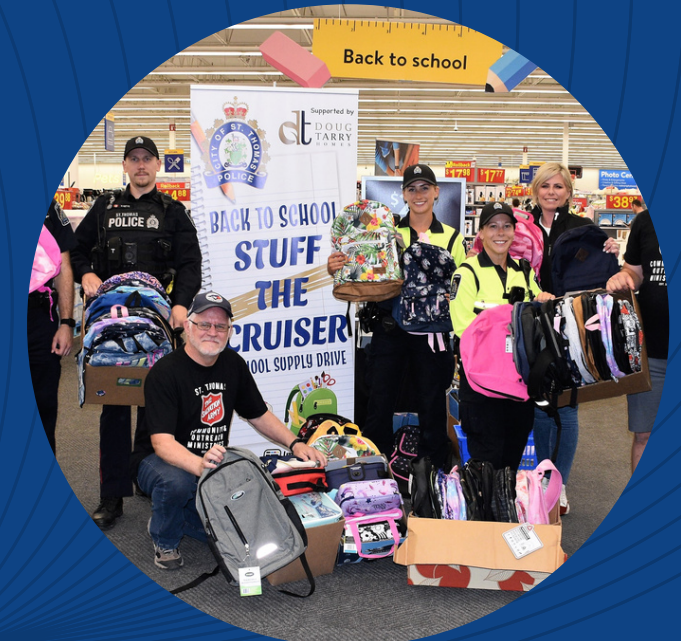
SCHOOL SUPPLY DRIVE