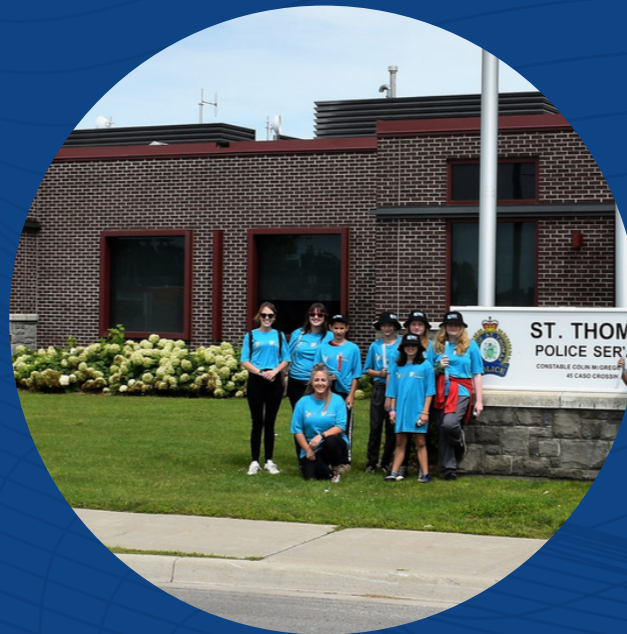
KIDS & KOPS